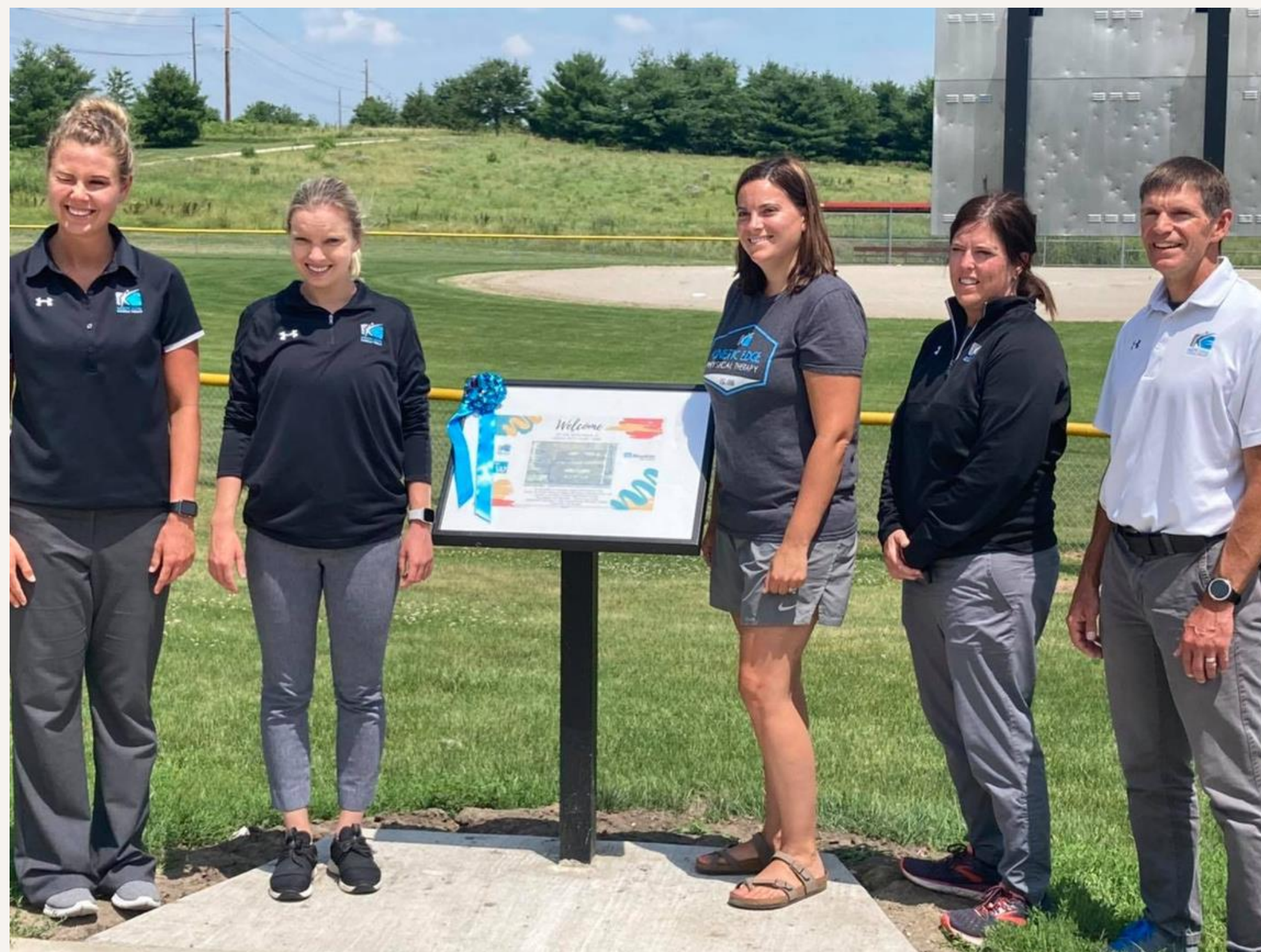
Kinetic Edge Physical Therapy provided $5000 for our project

Funding is easy for this one- no really!!