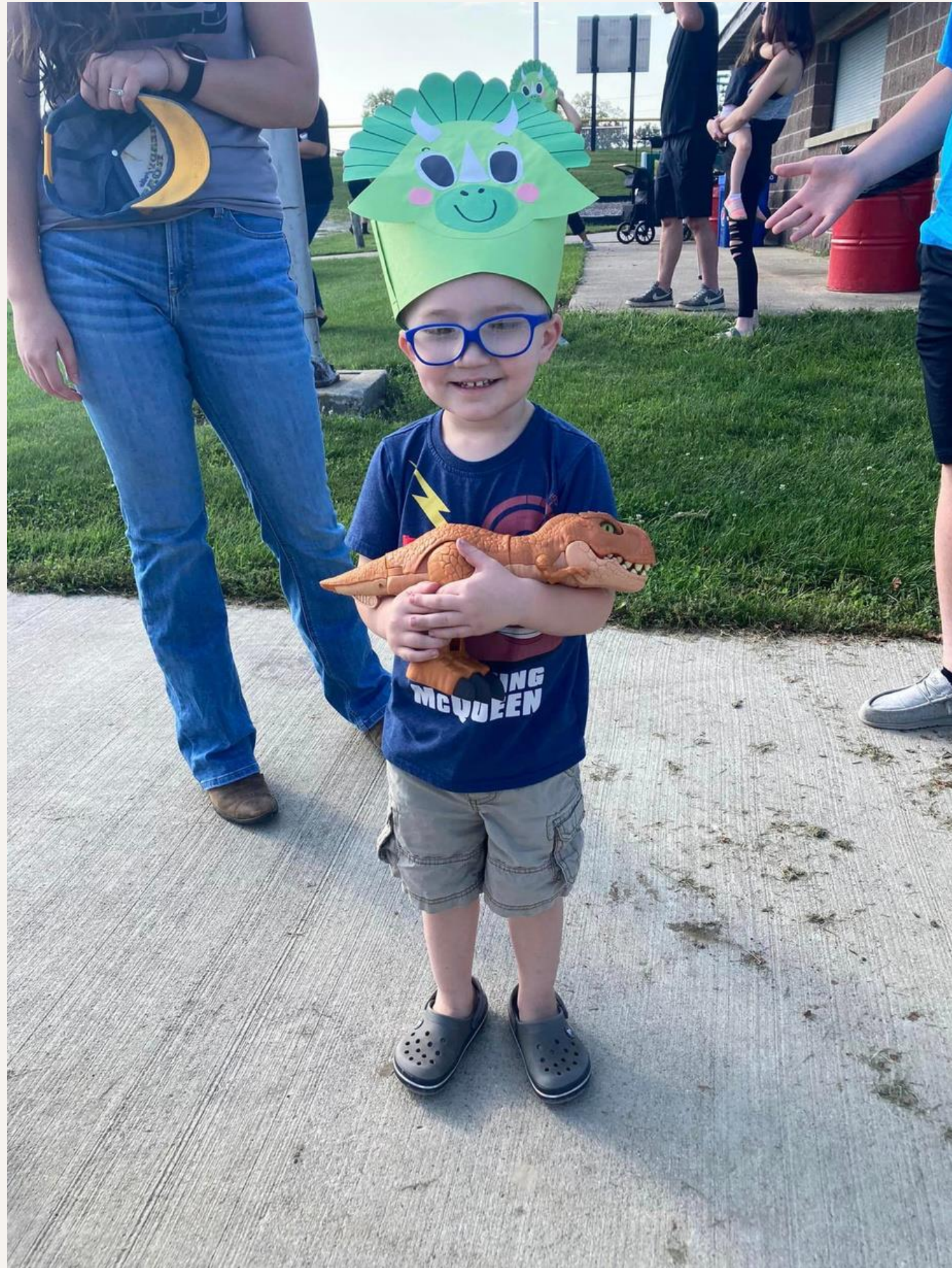
Dino Stomp event