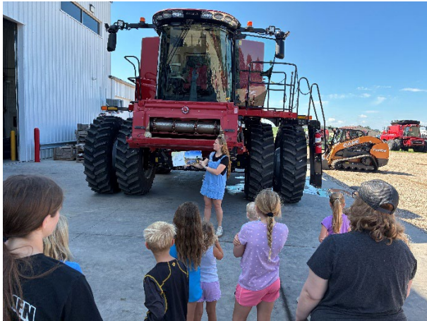
Orange City Public Library's Touch a Tractor Storytime: